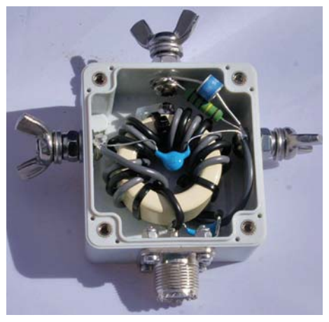
PHOTO 2: The 1:1 transformer and associated parts. The black wires connect to the SO239 input socket and the grey wires to the loop counterpoises and vertical antenna.

a third loop counterpoise over the other two counterpoises, which proved that they can be overlapped. As the loop counterpoises are not resonant, their size, shape or any overlap is not critical. Just use the area you have available to lay insulated wire in loops.