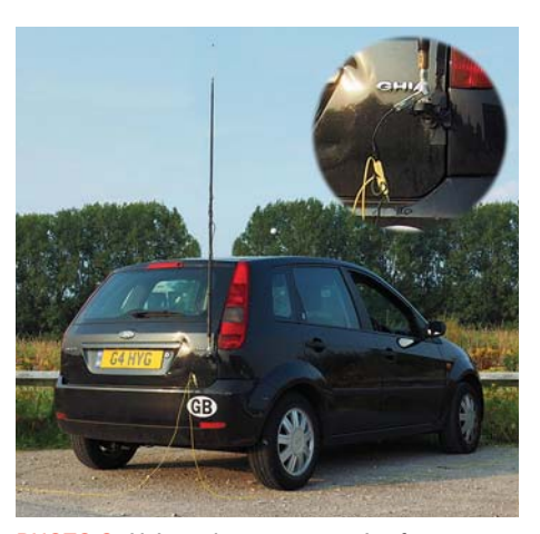
PHOTO 3: Using a loop counterpoise from a parked car (inset shows the alligator clip connecting the loop to the ground part of the antenna mount).

TABLE 1: Measured noise levels. Noise level S-meter reading Band (2400Hz bandwidth) 160m -100dBm S5 80m -93dBm S6 S4 60m -104dBm S5 40m -97dBm S5 S4 -97dBm 30m 20m -107dBm 17m -115dBm S3 15m -115dBm S3 -117dBm S2 12m SO 10m -123dBm